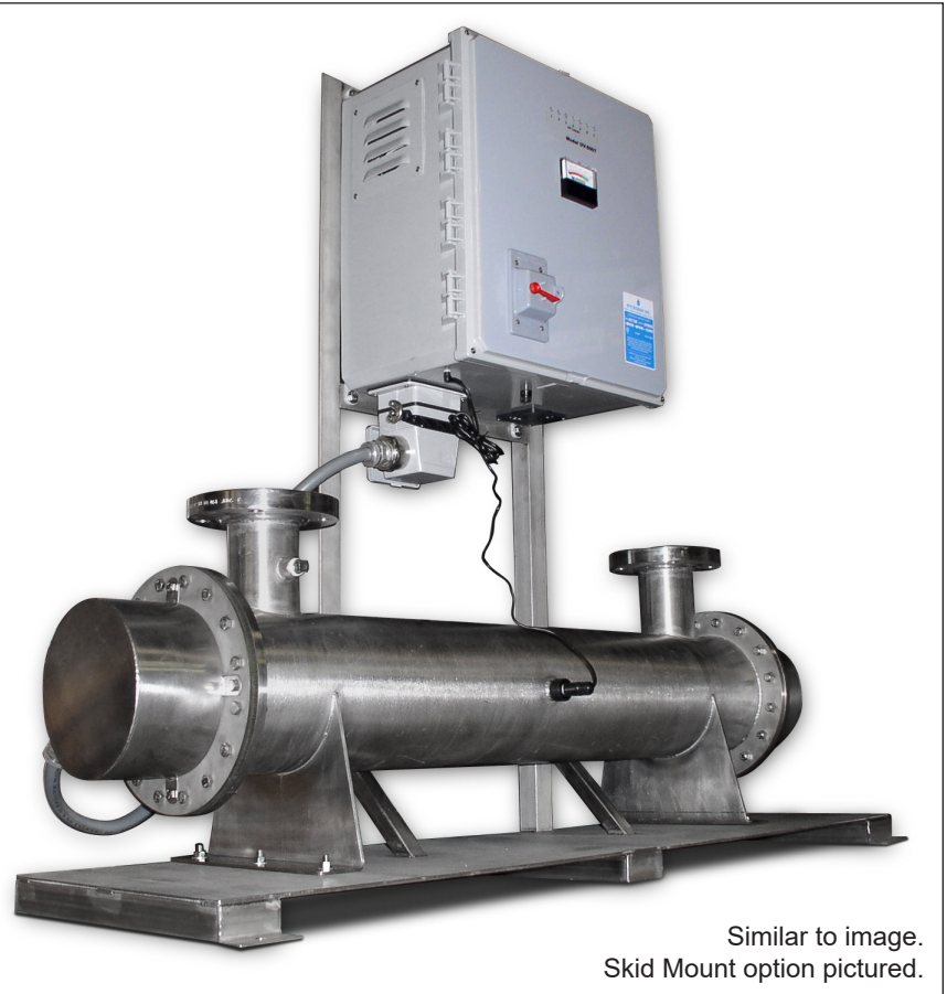
Similar to image. Skid Mount option pictured.