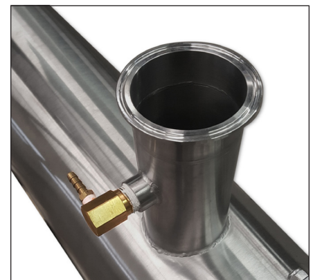
Also available with Sanitary Fittings