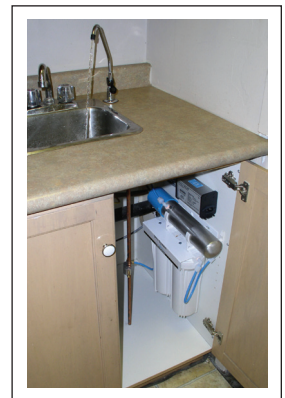
Typical Installation for drinking water under the sink