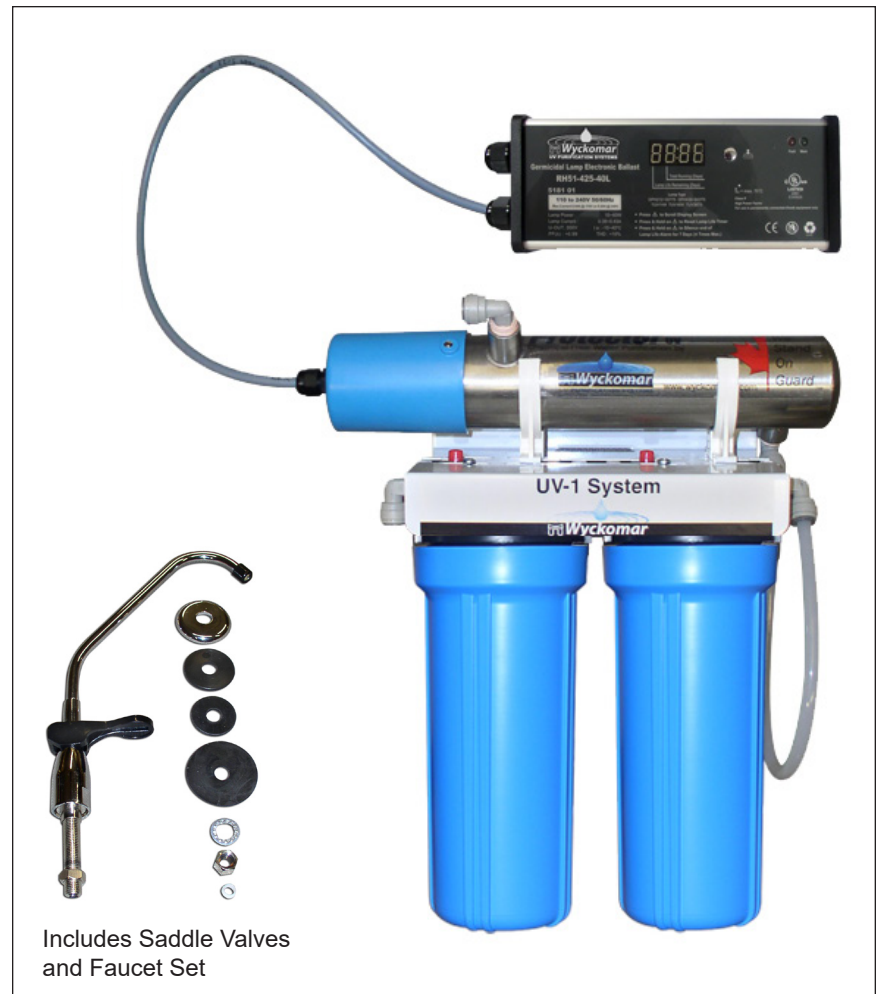
Includes Saddle Valves and Faucet Set