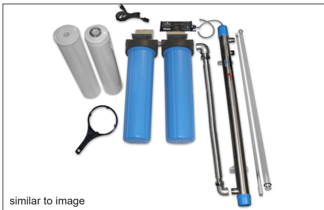
similar to image

The system ships complete with all necessary components and installation hardware